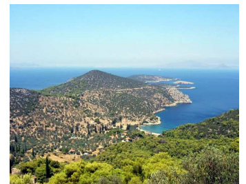
View to north of Poros