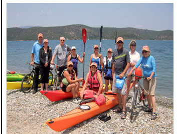
Paddle and cycle day trip